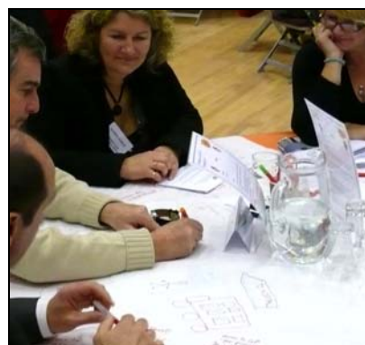
Scrutiny Café in action.